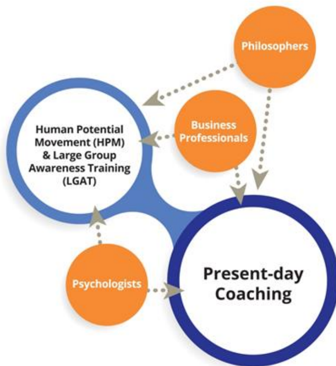
Figure 2. Influences on Coaching

Carl Rogers was one of the founders of the field of humanistic psychology. He emphasized the need to focus on and maintain a presence with the client (Rogers, 1957). Albert Bandura, a social psychologist, provided a significant contribution to